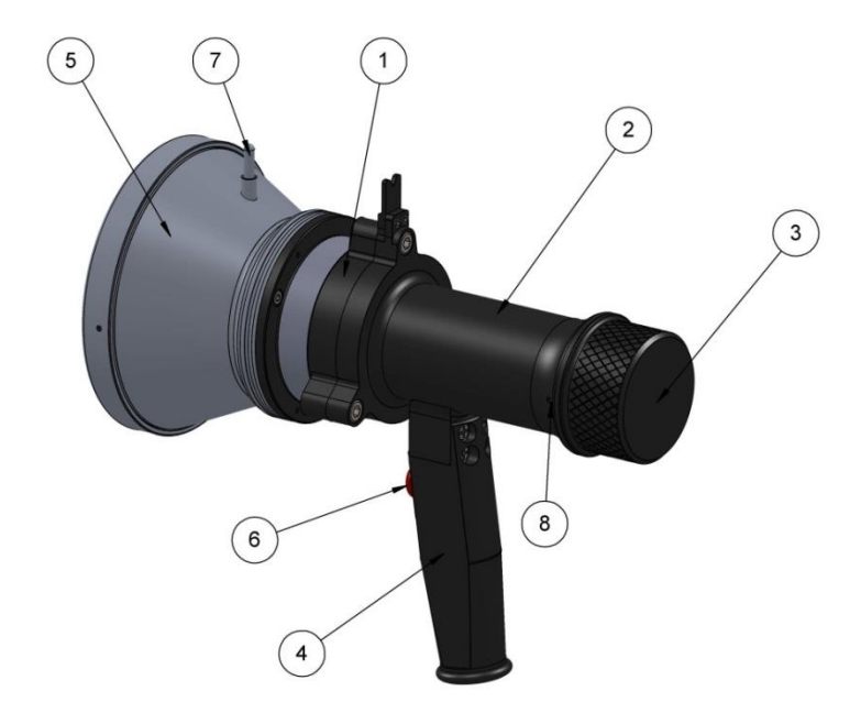
Figure 1: Flame Simulator Side View

To charge or replace the battery pack, follow the instructions in section 3.6 on page 24.