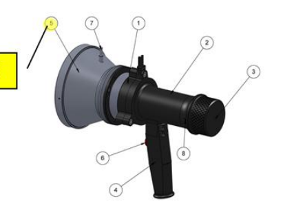
Figure 5: FS-1100 reflector diagram