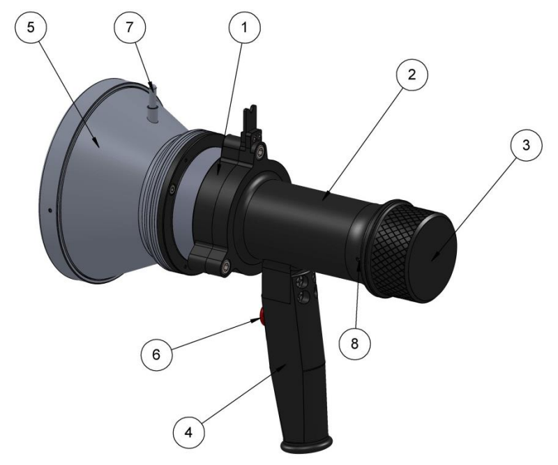
Figure 1: Flame Simulator Side View

To charge or replace the battery pack, follow the instructions in section 3.6 on page 23.